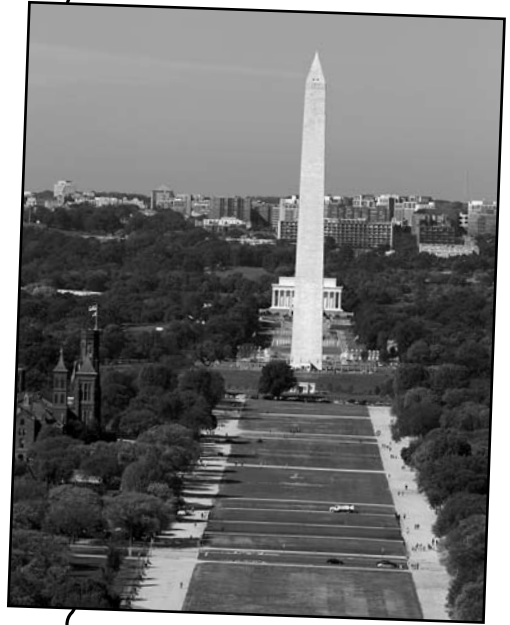
▲ L'Enfant's "grand avenue," the National Mall.

French city planner Pierre L'Enfant was chosen by President Washington to design the new city. L'Enfant decided on a grid system with intersecting streets centered around the Capitol Building, which would stand at the top of a hill. His design included a garden-lined "grand avenue" in the center and canals filled with water. Eventually L'Enfant lost his job after too many disagreements and his design was changed, but much of his original grid plan can be seen today, including the tree-lined "grand avenue" that is now the National Mall.