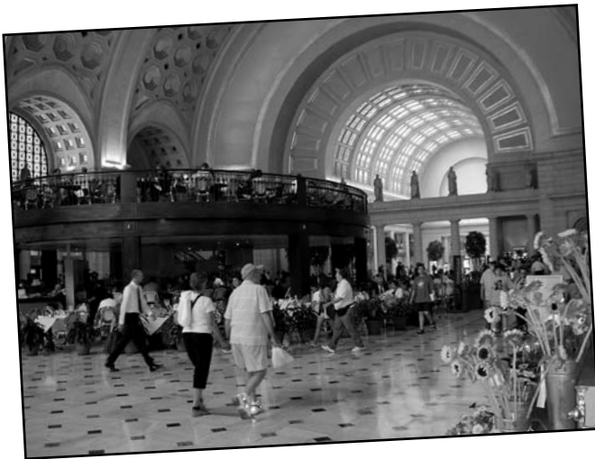
▲ Inside the main hall in Union Station.

Union Station opened on October 27, 1908, with the arrival of a B&O passenger train from Pittsburgh.