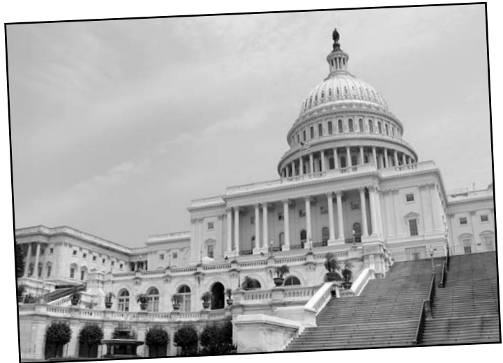
▲ The U.S. Capitol sits atop Capitol Hill.

The Capitol is home to the U.S. Congress and its two legislative bodies, the U.S. Senate and the U.S. House of Representatives.